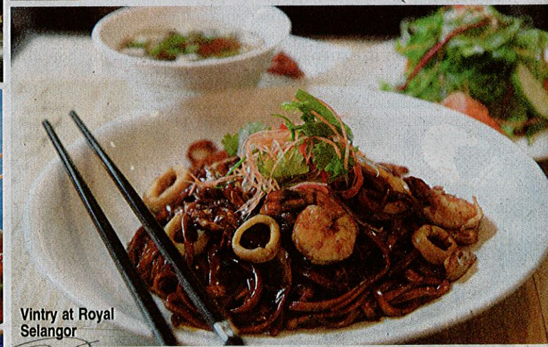
Vintry at Royal Selangor

Coffee Club burger, Skipper's Delight Penne, baked shrimp and ham pasta, piri piri chicken and fish and chips.