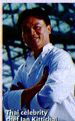
Thai celebrity chef Ian Kittichai

A month-long celebration of Asian cuisine, culture and lifestyle await gourmets at this culinary event. Food aficionados can look forward to over 20 gourmet activities including demonstrations, workshops, luncheons, gala dinners and tastings. There are also lifestyle events that revolve around the performing and visual arts, fashion and clubbing, with a thread of gastronomy weaved into the programme.