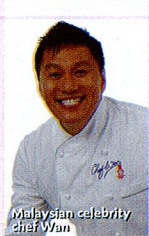
Malaysian celebrity chef Wan